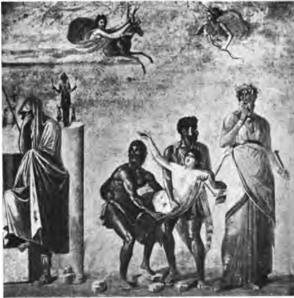
Fig. 89. Sacrifice of Iphigenia.

offered her as a sacrifice. At the moment when the knife was about to descend upon her, Artemis snatched her away to serve as priestess in her temple at Taurus, putting in her place a hind. Then favorable winds brought the fleet to Troy.